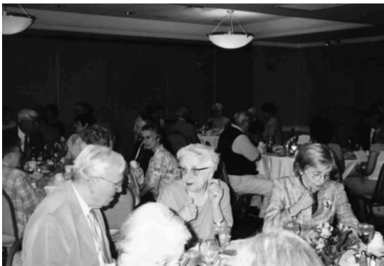
A portion of the crowd figuring strategy for the raffle