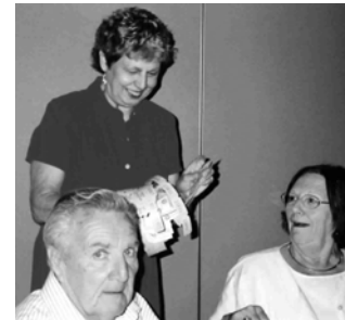
Sure makes one smile to see the money roll in!