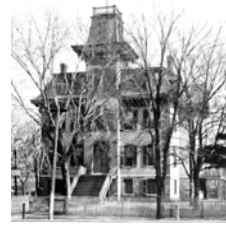
Home for the Friendless Memorial