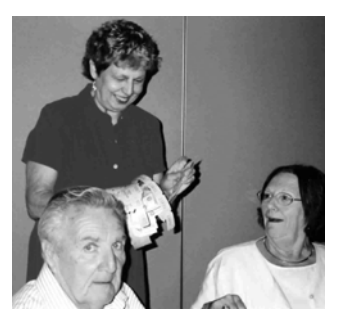
Sure makes one smile to see the money roll in!

tory of members and reports of Society activities over the years to celebrate its 45th anniversary this year.