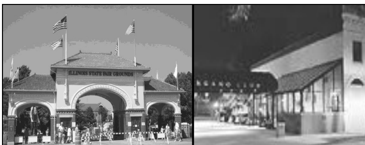
IN THE OFFING: Fair Facts, Sangamo Celebration

Representatives of the Illinois State Fair Museum Foundation, which operates a small museum on the site during the 11 day exposition, will provide a historical texture to an annual event that draws several hundred thousand visitors to