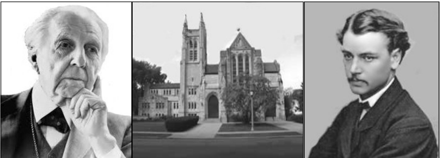
FAMED architect Frank Lloyd Wright (left) and Robert Todd Lincoln, Abraham Lincoln's son (right) added to the history of Westminster, Wright designing its flower stands, Lincoln underwriting the chancel stalls. Westminster is at center.

In 2003 Westminster dedicated a $2 million renovation of its building and organ, updating classroom spaces and offices, extending the chancel, and im-