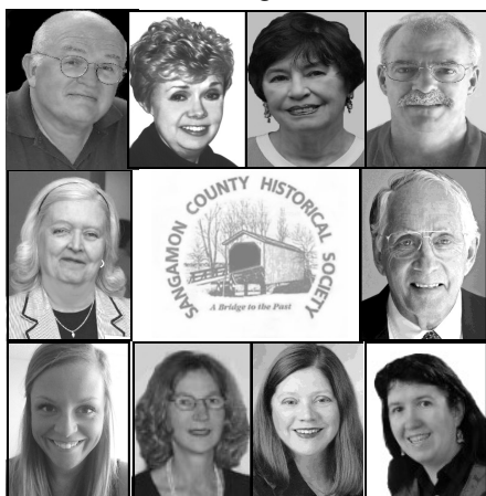
MEET THE NOMINEES: PAGE 4