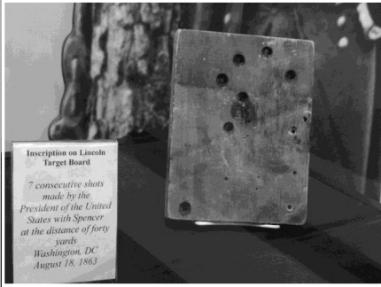
Inscription on Lincoln Target Board 7 consecutive shots made by the President of the United States with Spencer at the distance of forty yards Washington, DC August 18, 1863