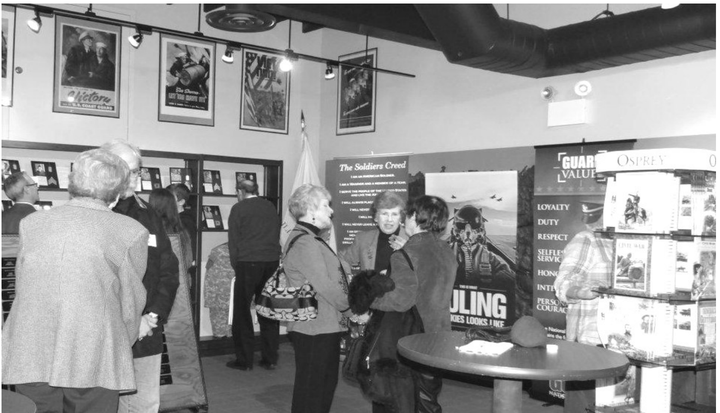
THE MUSEUM'S extensive exhibit includes a variety of artifacts that Society members were able to browse through during the tour.